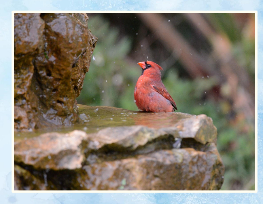
Northern Cardinal splashing around