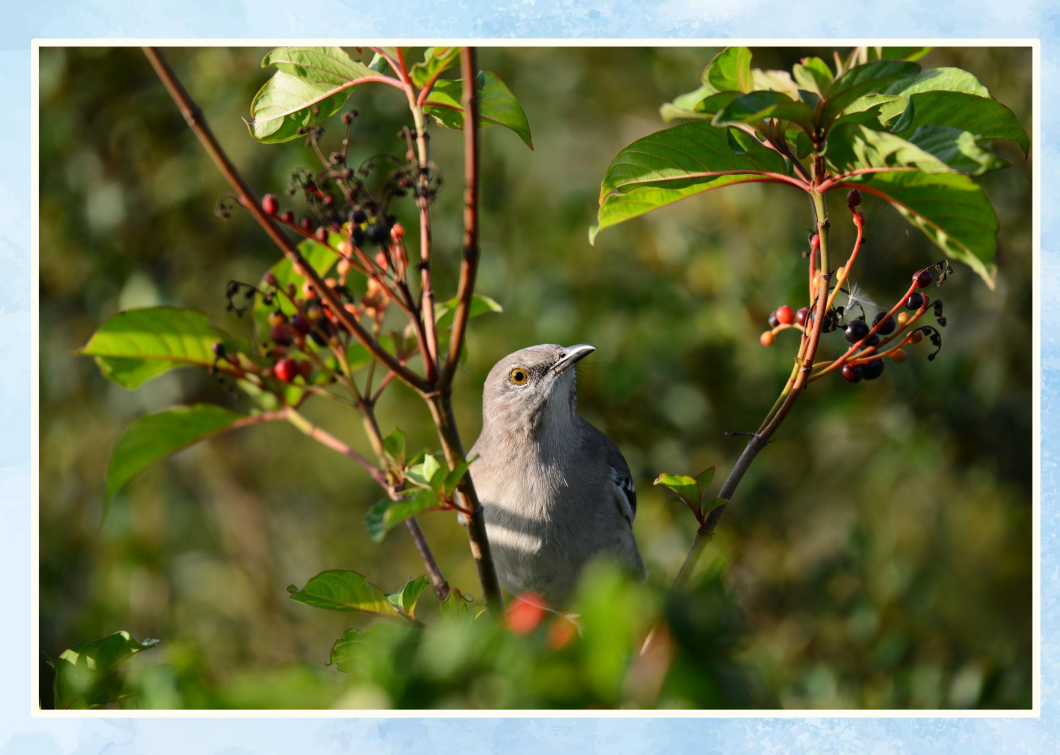
Northern Mockingbird on a Firebush