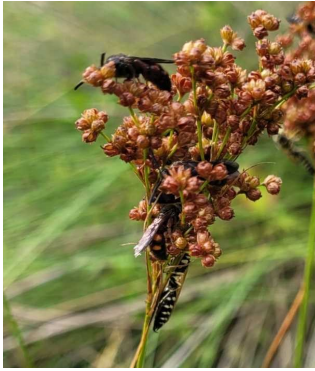
Longhorn Bees roosting

Some other important garden features that support bee populations are water sources and nesting sites. Shallow dishes with a rough texture are ideal for bees. Smooth surfaces can lead to pollinators getting trapped in the water and drowning. Nesting sites include bare soil for ground-dwelling bees, clumping grasses, and dried, hollow stems. Leave dried stems over winter for nesting and resting sites. If you go out in the evenings, you can often find bees sleeping on the stalks of dried flowers or the seeds of grasses and sedges!