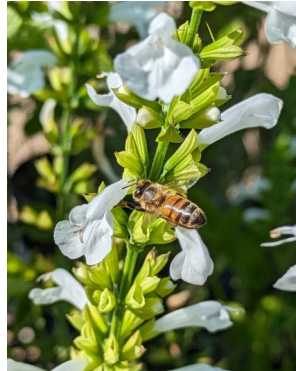
Honey Bee on Tropical Sage