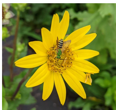
Sweat Bee on Starry Rosinflower