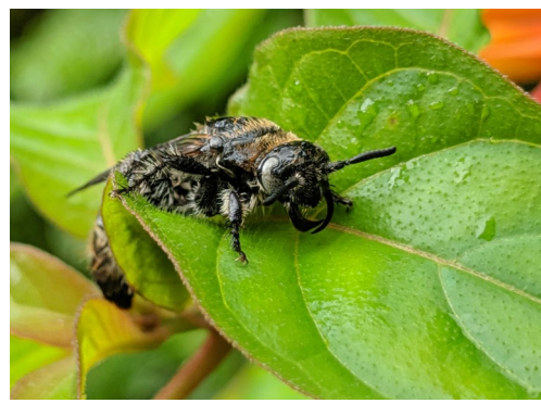
Leaf cutter bee on Firebush